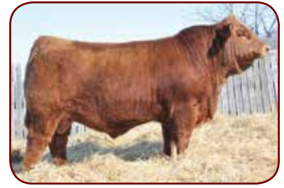
Maternal Brother of Lot 98 & 2019 Futurity Champion: BLB Grid Iron 16G

BLB Hellcat 26H is another standout FLAD Element 21E son that has a bright future. He is a maternal brother to the 2019 Futurity Champion, Goodview Grid Iron. Hellcat stands at the top of our pen in both eye appeal and performance. Exhibiting an ADG of 4.25, WDA of 4.12 and indexing at 113. BLB 26H has a big top, tons of hair, a big middle and a scrotal of 42cm. His dam, BLB Winnie 31A is a standout Outback daughter that knocks it out of the park. The Winnie cow family produces very functional and eye appealing cattle. We are excited to see what this bull's future will bring. Retaining half semen interest. HOMO POLLED.