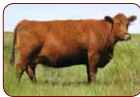
WJD 51F Dam of Packer