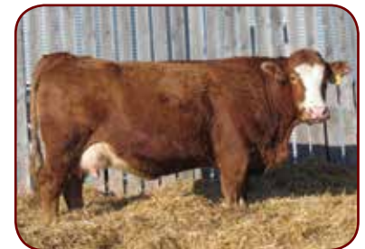
Dam: Grinalta's Honey DPF64D

In the spring of 2019, we were looking for an outcross polled fleck bull. We acquired a semen pack on Sibelle Pol Darwin as he was a heavy muscled, easy fleshing, cherry red bull from the great Sibelle program in Quebec. We flushed two of our homo polled donor cows to him that spring and bred some other fleck cows as well. All his calves demonstrate extra stoutness right from birth. True to their sire, they are heavy muscled, wide topped and powerful. Charles' dam is our Honey cow that we selected in the spring of 2017 when we had pick of the open heifers at Grinalta Farms. We have a full sister in the replacement group that is a standout. Charles offers outcross genetics to much of the Fleckvieh breed and is worth the drive to see him in the flesh.