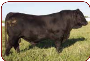
Sire: RWG Captain 5701

BLB Heavy Hitter 15H is an extraordinary bull in our pen. A frame score smaller than the average in our pen but the phrase "as wide as he is tall" describes him to a T. A son of BLB Wilma 1W, the senior cow in our herd and easily a top producer who has produced BLB Bud, the sire of BLB Diplomat who is the sire of BLB 39G who makes his home in North Dakota at Prairie Hills Gelbvieh. 15H is sired by RWG Captain who sires progeny that are big middle, heavily muscled and exhibit a beauty disposition. BLB 15H will sire those moderate, big ribbed offspring that the industry wants.