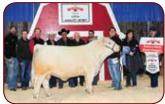
Sire of Lot 40: SOS Hooley PLD 127D