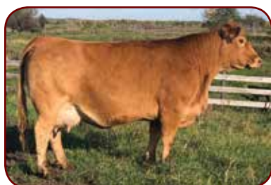
Dam of Lot 97: