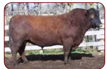
Sire: Red GEIS Zama Pine 123'03

We decided to go back to the well and AI'd a few of our top cows to our Zama Pine 123'03 bull. He was one of the most consistent female makers we have used, leaving us with several daughters still working in the herd. All the Zama daughters have exceptional udders and excellent feet. Customers who have purchased Zama Pine sons in past sales have commented on their longevity and maternal strength. The Zama Pine 6H bull is a good one with eye appeal, style, and natural thickness. This guy could lead off the catalogue but fitting that we close out our offering with a throw back to the past. Twin.