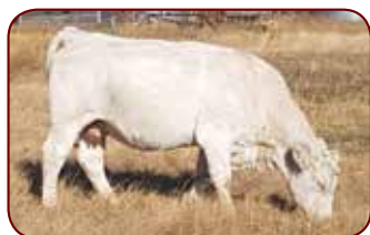
Dam of Lot 36: Steppler Miss 331E

8H is a pen favourite. Talk about royalty in the blood. SVY Wizard 707E, SVY Starstruck 409B on the top side and the $100,000 Sparrow's Braxton on the dam side. The shape and athletic ability along with a thick, curly hair coat make this bull one to watch. DSY 331E has a perfect, uptight udder and has great feet and overall structure. Backed by some of the best herds in the industry. The predictability in this bull is insane. Check him out.