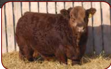
Sire: Crossroad Warrior 131F