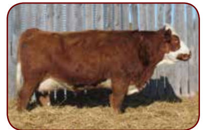
Dam: Fairview Cherry 1D

cow and has a perfect udder with lots of milk (I don't give that grade easily). Informer's full sister is one of our top bred heifers this year and she will be a key piece in our Fleckvieh program going forward. Philosophy is starting to establish himself in the breed as an easy calving bull with added performance, muscle and pigment while leaving all his offspring polled. Informer has excellent calving ease numbers and with Philosophy and Seldom in the pedigree he would work on heifers, yet he weaned off at 902 lbs. mid-September, so there is no doubt he will sire some excellent calves.