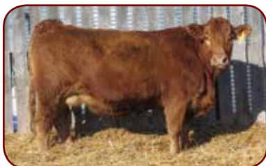
Dam: Fairview Daisy 83E