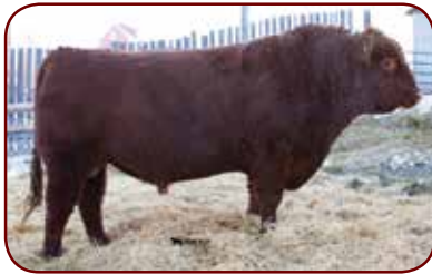
Red Lazy MC Detour 161D

Detour 161D continues to exceed our expectations of a herd bull and has left us a strong set of bulls and replacement females the last few years. The bulls are moderate built with good muscling and moderate birth weights. Backed by the exceptional dam, Detour 161D's daughters are moderate framed and good uddered. If you are looking for moderate framed bulls with good testicle development and moderate BW calving ease... check out the following sons.