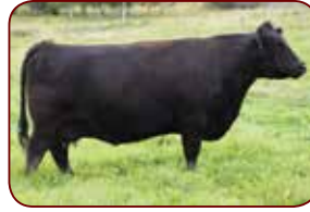
JLL 4W Dam of Final Deal