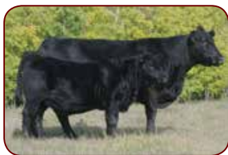
Dam & Sister: Black Ridge Gammer 23U

Check out the bulls on our Black Ridge Angus Facebook page closer to sale day