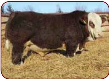
Sire of Lots 64, 65 & 66: SIBELLE POL Darwin 21F

HOMOZYGOUS POLLED. NON DILUTOR. 100% FLECKVIEH.