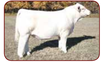
Sire of Lots 35-39: SVY Wizard 707E (as a yearling)

This Wizard son catches your eye every time. Moderate birth weight, solid feet and legs and out of a moderate Copenhagen cow that always raises a big calf. These Wizard sons continue to impress us with their great dispositions and fault free structure. 14H has that attractive look that he will pass on to his offspring that will sure to top any market anywhere.