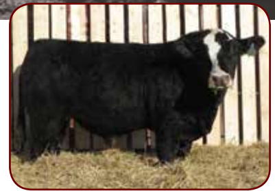
Maternal Brother sold in 2020: Fairview Mastermind 92G