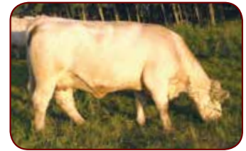
Dam of Lot 38: HBC Melissa 212Z

HOMOZYGOUS POLLED. 2H is typical of the Wizard sons we have on offer. He is great footed, big nutted and quiet. Our Wizards calved unassisted and never looked back. They grow, are easy to feed and easy to be around. 212Z is a very consistent cow that have put many bulls through this sale and this year had the second-high selling bred heifer in the Sterling Collection Sale to Johnson Charolais in Alberta.