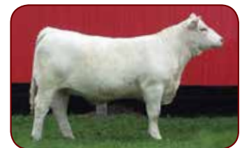
Dam of Lot 42: HBC Bright Lights 509C

A Cortez son with all the power of his sire along with a great, young Fire Water cow that produced HBC Temptation 802F, the dam of HBC Summit 1H. Again, power in the genetics. 28H will add pounds baby! Don't walk away from this one with loads of potential.