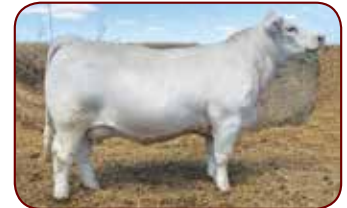
Dam of Lot 34: HBC Temptation 802F