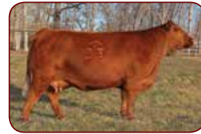
YY 701T Dam of Detour