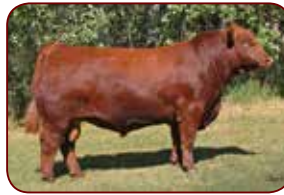
LDEL 2W Sire of Detour