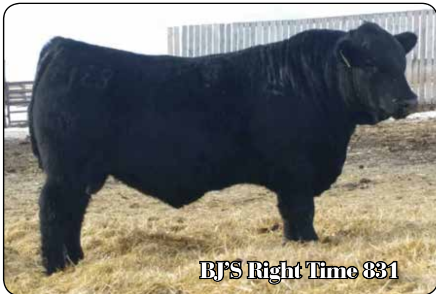
BJ'S Right Time 831

A Right Time son who has a wide top, stand square and of moderate frame. He has great hair and a great foot. His pedigree is stacked full of great cows and sires! His dam is an excellent young cow, who has calved in an 18-day window on her last three calves.