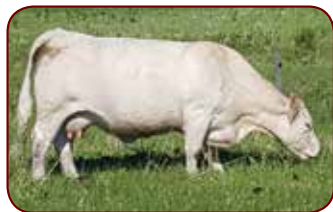
Maternal Granddam of Lot 35: HBC First Date 412B

HOMOZYGOUS POLLED. White Claw is everything we like to see in a herd sire! He was a standout since birth. He's big bodied, soft made, big footed, big scrotal and has the herd bull presence! Not to mention his stellar disposition! Like all of the Wizard calves, he is powerfully built and high libido. His dam, HBC Royal 719E is a tremendous female who is super thick made, deep bodied, and paired with a tidy square udder underneath. She is in the top 1% of the breed for WW and YW EPDs! Like his mother, White Claw is very sound, athletic and loaded with volume! White Claw is homozygous polled by pedigree, has a moderate birth weight, and is super attractive in his design! This bull is a bull you don't want to miss!