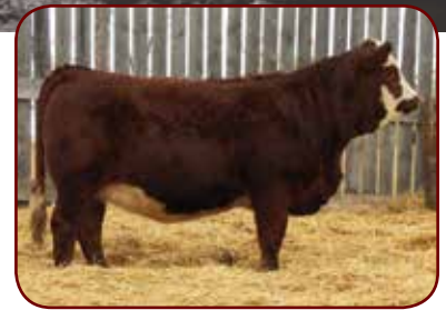
Full Sister to Lot 67: Fairview Marci 57G

Kingpin is a transplant son of our Miss Marcus "Marci" donor cow. This will be one of the last opportunities to own a Marci son as she is now deceased. She was a long-bodied, beautiful uddered female with lots of capacity. She is the dam of our Zeus bulls we sold a few years ago whom went on to work in some purebred and top commercial herds. Kingpin is sired by our $20,000 Philosophy bull that now has AI progeny in some of the top Fleckvieh herds in Canada.