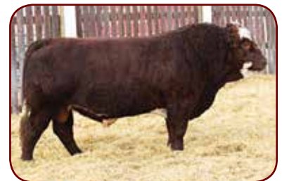
Sire: Fairview Philosophy 99E