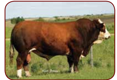
Maternal Grand sire: KUZ Mr Colossal 427Z