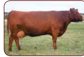
RCMP 7P Granddam of Final Deal