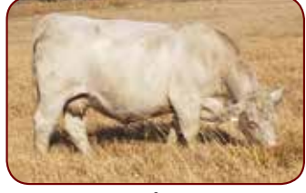
Dam of Lot 40: Wood River Glamourous 9A

Take note here! A smooth polled SOS Hooley son that pounds down the scale. He is an impressive, deep sided son of a gun, fault free and quiet. This guy moves and looks like a herd bull. His dam was a high seller we purchased in the Wood River Female Sale a few years back and she has lived up to her billing. She is moderate, deep and very quiet. Her udder is made the way it should be – up tight, loads of milk and perfect teat size. 20H is the image of his sire, SOS Hooley 127D. Great genetics in a picture-perfect package. Study him closely. He won't disappoint.