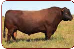
Red JLL Final Deal 78Z