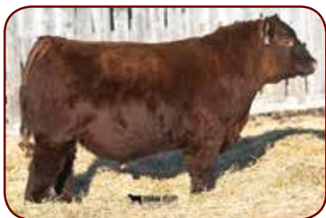
Red Twin Heritage Detour 24F