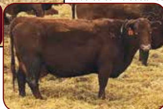
Dam: Red Twin Heritage Navanna 5A

Detour 66H is a full brother to Detour 33G which was one of our high sellers last year to Addis Farm Ltd. His dam is a big ribbed, great uddered cow that stands out in the herd. Knowing how consistent the Navanna cow family has been throughout the years, 66H is one to look for come sale day.