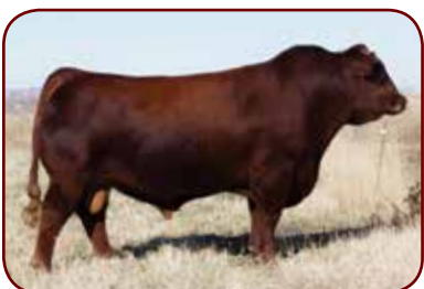
Maternal Grand sire of Lot 101: RWG Right Combination 5506

BLB Hall of Fame 33H is so cool. Liver red in color, huge rib shape and big hipped. He is a moderate framed bull that will work on both heifers and cows, boasting a very low BW of 73 lbs. We purchased his dam, FLAD 23F out of the Function and Finesse Sale from Fladeland Livestock. She is a RWG Right Combination daughter with a perfect udder and teat shape as well as a puppy dog disposition. BLB 33H is a bull that will sire moderate offspring with volume and will be phenotypically correct. Heifer bull. Retaining half semen interest. HOMO POLLED.