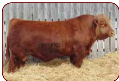
Sire of Lots 97, 98, 103, 106, 107, 109 & 110: