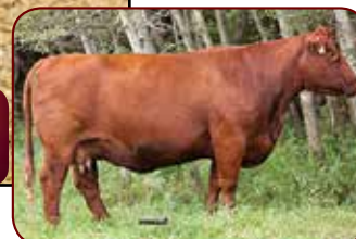
Dam: Red SSS Blockanna 671X

Detour 10H is a smooth fronted bull with good eye appeal, length, and testicle development. His dam, 671X, was a former high selling bred heifer from the SSS herd and always raises a top end calf. She consistently breeds back early and has had six herd bulls averaging 92 lb. BWs and a weaning index of 103%.