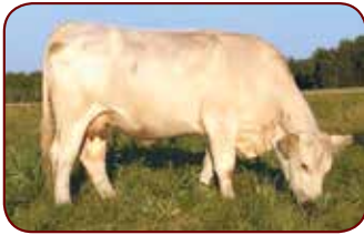
Dam of Lot 39: LAE Brandy 4141B

This big, long tank of a bull will put pounds on your calves. Recommended for bigger cows. 15H was born unassisted from a moderate no-miss cow, 4141B. If that cow seems familiar, she is! She has produced herd bull after herd bull. The mother of HBC Ransom, the tremendous HBC G2 son that walks at Balamore Farms, Nova Scotia. Her sons are always at the top of the pen for growth. Add 15H to your bull battery and have fun selling those big, market topping steers!