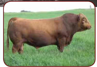
Sire: MRL Sleep Easy 140D

Sherman is a real feature bull. He is soft made, free moving with a big, deep quarter and loads of capacity. His sire, MRL Sleep Easy goes back to the great 836W donor cow making Sleep Easy a brother to MRL Capone and MRL El Tigre. Sherman possesses some serious performance as he started off at a mere 80 lbs. and weaned at 861 lbs. His EPD profile also backs up this curve bending quality as he is above breed average in all traits, being in the top 25% or better on many. Sherman is a very attractive red baldie bull loaded with maternal strength you can count on.