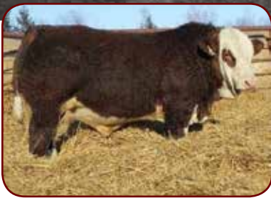
Sire: SIBELLE POL Darwin 21F

Beagle is another powerful, thick made Darwin son that is full of meat and muscle. He has a real wide top and thick round quarter similar to his brothers that start our section of the catalogue. His dam is an excellent young female from our Sering cow family. These females have good udders with lots of milk and are always some of our best producers. Beagle will mature into an excellent herd sire who will make an impact on his new herd.