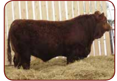
Full Brother to Lots 83 & 84: Fairview Professor 51G