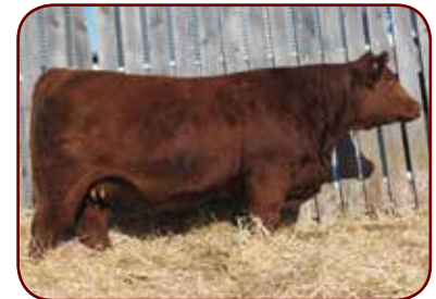
Maternal Sister to Lots 83 & 84: Fairview Eve 51F