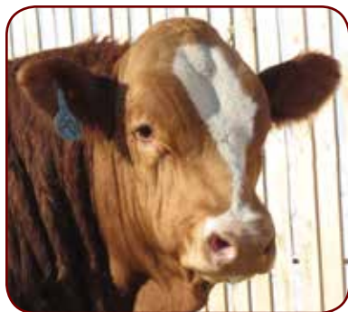
Fairview Mountain 109H