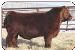
Red Wilbar Packer 51F