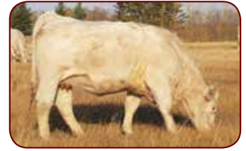
Dam of Lot 41: HBC Paris 816F

HBC Cortez, the sire of 21H, was the highest performing and most complete son of JWX DOWNTOWN that we raised and out of one of our top cow families as well. We used him as clean up to our AI program and by the looks of his calves, we should have used him more. 21H