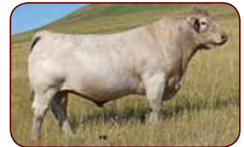
Sire of Lot 34: WCR Commissioner 593 P