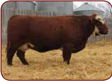
Dam of Lots 65 & 66: KEATO PLD Eloquence 18E