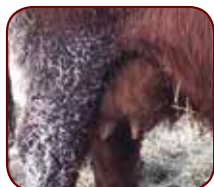
HFx 42Z Udder after calving

These Packer sons are moderate in size, but they do not give up any muscle or eye appeal. Packer 31H is smooth fronted, strong footed, and has a beautiful deep red color. He is backed by a solid uddered, moderate framed dam that traces back to the Rachel cow family at Ter-Ron. She has raised previous high selling bulls and we have retained every daughter from her.