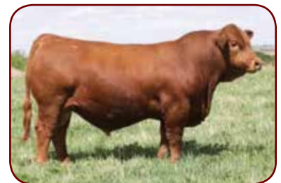
Sire of Lots 99 & 102: RWG Exact Combination 7409

BLB Hawkeye 7H is another exceptional bull exhibiting a dark red coat, a huge hip and large rib shape. Hawkeye is a son of RWG Exact Combination who has worked very well in our herd. His dam is a Sucker Punch daughter that we purchased from Prairie Hills Gelbvieh in North Dakota. This mating really clicked, and we are excited for his future. We hope to use Hawkeye in our herd at some point. Retaining half semen interest. HOMO POLLED.